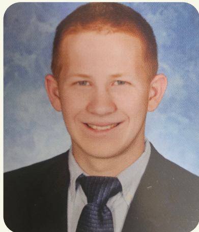
Senior Picture, 2015