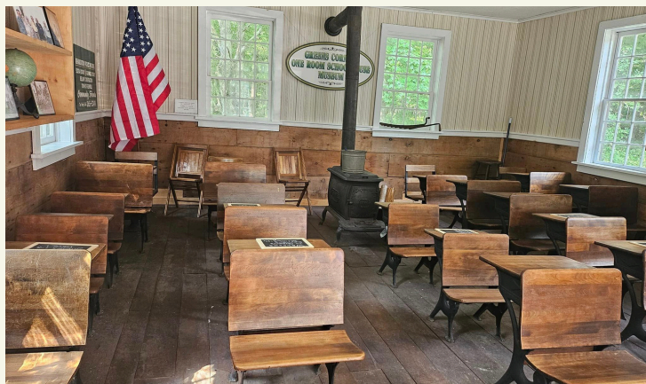
Greens Corners One Room Schoolhouse 1823-1946