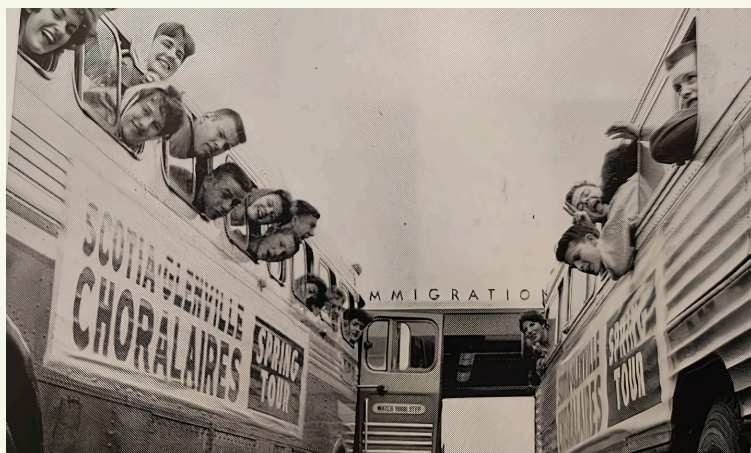
Choralaires Tour, 1962

Our vision is to continue Tartan Pride beyond graduation and to promote the legacy of our school: "Once a Tartan, Always a Tartan."