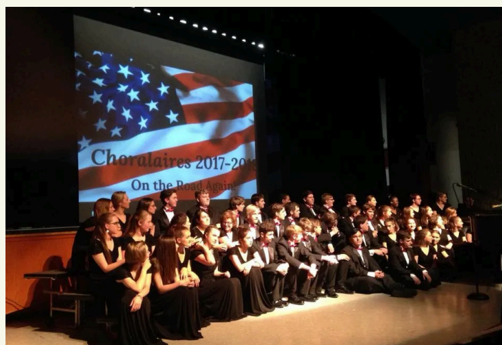
Choralaires in 2018