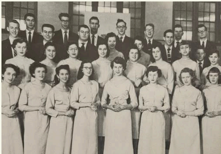
First Year of Choralaires, 1953-1954